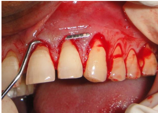
Figure 2: - Creation of pouches and making a tunnel in the gingival tissue.

region using a trapdoor technique (Figure 3). The graft tissue was trimmed to the required dimensions and inserted into the tunnel and secured to the recipient bed and adjacent gingival tissue with 8-0 Vicryl™ sutures (Figure 4). The surgical site was dressed with Coepak™ and patient was prescribed analgesic and antibiotic for 10 days.