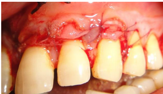
Figure 4: - Connective tissue graft secured in place covering the gingival recession with 8-0 sutures

On observation during the recall visit after 10 days, the surgical site revealed complete root coverage in relation to the incisors and canine (Figure 5). The patient was followed up to a period on 6 months during which negligible amount of recession could be observed (Figure 6).