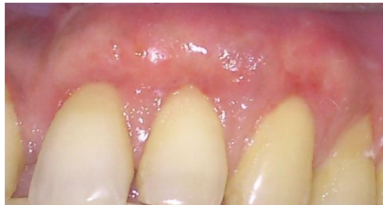
Figure 6: - 6 months post-operative healing. Complete coverage of gingival recession