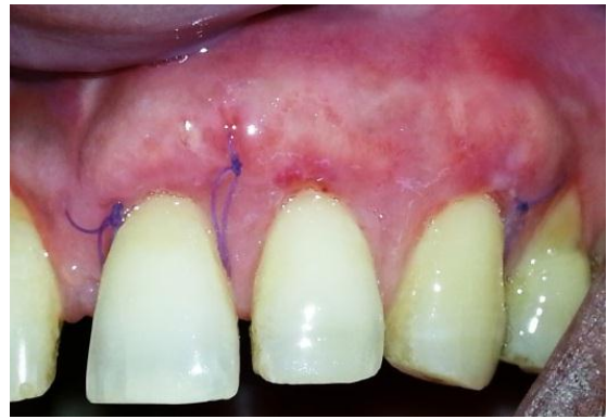
Figure 5: - 10 days post-operative healing showing near complete root coverage

On observation during the recall visit after 10 days, the surgical site revealed complete root coverage in relation to the incisors and canine (Figure 5). The patient was followed up to a period on 6 months during which negligible amount of recession could be observed (Figure 6).