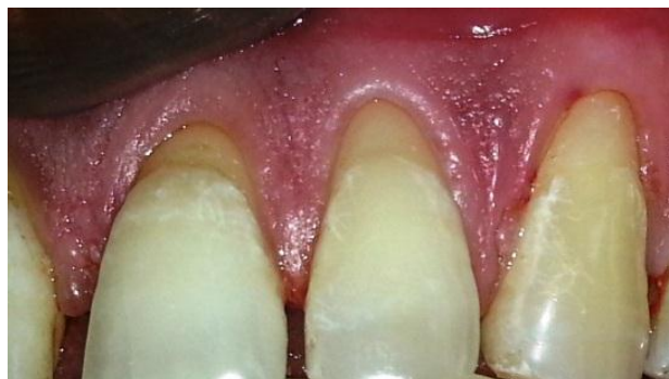
Figure 1: - Miller class I gingival recession in relation to maxillary left incisors and canine.

A 29-year-old male patient reported to the Department of Periodontology at Teerthanker Mahaveer Dental College and Research Centre, Moradabad, Northern India, with the chief complaint of long looking teeth in the upper jaw. The patient was particularly concerned regarding his esthetic appearance when smiling. After obtaining the patients consent thorough medical and dental histories were taken. Intraoral examination revealed generalized Millers class I gingival recession (Figure 1).